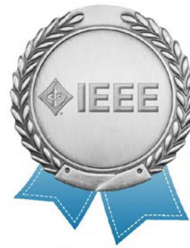
2017 Outstanding Section Membership Recruitment Performance Hong Kong Section