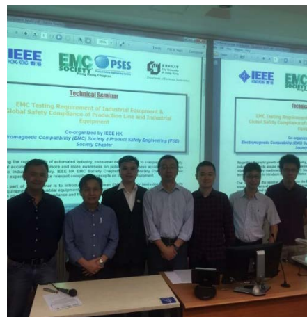
The IEEE Hong Kong EMC Chapter expressed gratitude to the speakers for the success of event

The IEEE Hong Kong EMC Chapter expressed gratitude to the two speakers for providing fruitful presentations and offering an opportunity for the audience to appreciate the latest development on the topics.