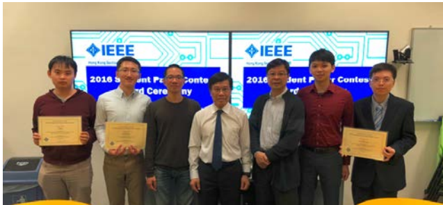
Group photo (2016 Winners and Section Officers)